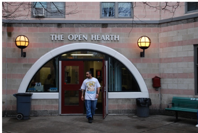
Main Entrance at 150 Charter Oak Ave. Hartford, CT

Development Coordinator at The Open Hearth